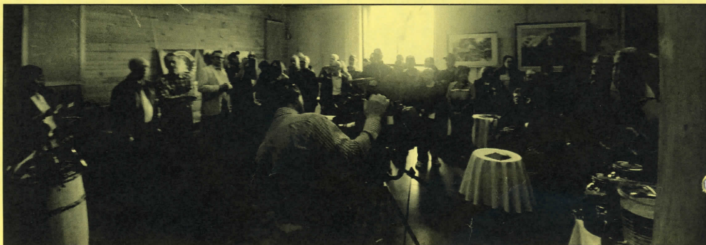
Below: The large crowd out to support the Christmas Tree and Grennery Industry.